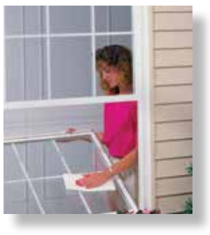
On the popular Double Hung window style where both sash move easily up and down, low-profile latches at the meeting rail release the sash to tilt in - allowing for interior and exterior cleaning to be done from the inside.